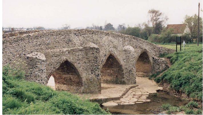
Packhorse Bridge, Moulton

20 At the X-roads with the B1061, go SA onto Stetchworth Road, SP 'Stetchworth 1, Woodditton 2^{1/2'} .